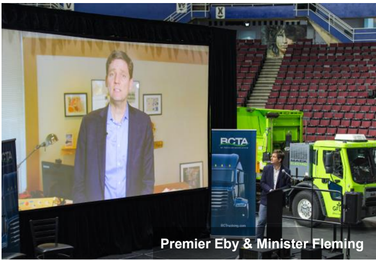
Premier Eby & Minister Fleming