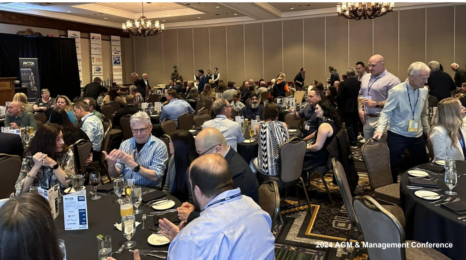
2024 AGM & Management Conference

We are proud of the success of this year's events and look forward to building on this momentum in 2025.